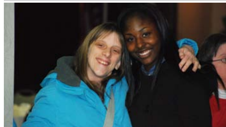
Enjoying the holiday season. ARC residents, employees and staff enjoyed the holiday's at the Rotterdam Elks Lodge. Each year the Elks host a holiday party for the individuals at Schenectady ARC. The event featured music, great food.

We are also seeking sponsors for the 5K Challenge. For available levels call ARC at 518.372.1160.