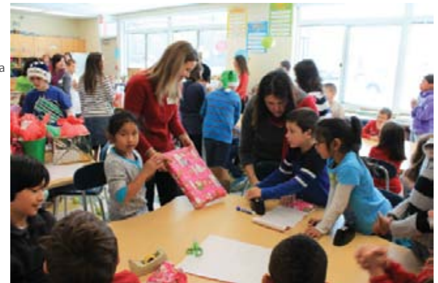
Students from Niskayuna's Craig School help wrap gifts for families through the Schenectady ARC Holiday Tree Program.