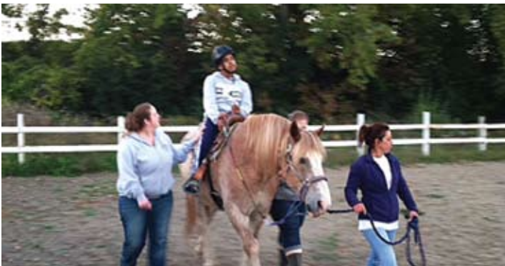
With help from the NYSARC Trust Grant, ARC individuals are enjoying recreational opportunities at Victoria Acres Equine Facility.

If you missed this year become a Fan of the ARC5K Challenge Facebook page to get update on the 2014 event.