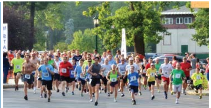
On your marks! The ARC 5K Challenge took place August 9 with a record 240 participants.