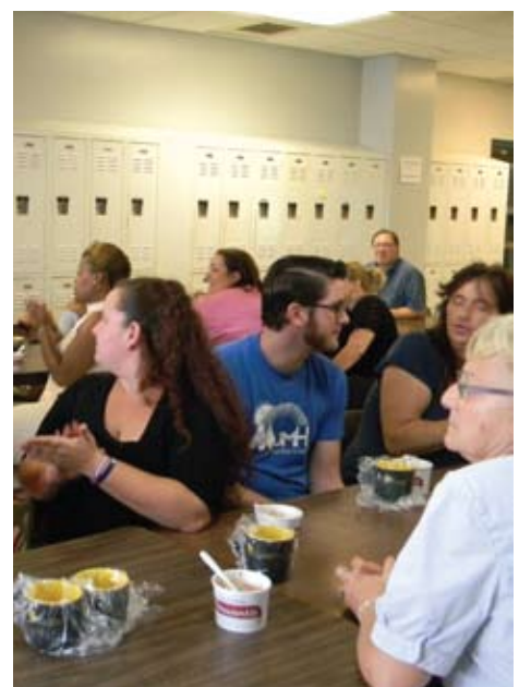
Applause for a colleague. DSP's at Pine Ridge Vocational Center celebrate DSP Week with the Executive Team.