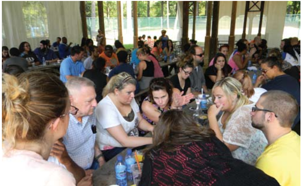
Celebration! Nearly all of our Residential Direct Support Professionals participated in a team building afternoon of trivia and a picnic lunch. The event was part of the DSP Week 2013 Celebration. It was held in Central Park, Schenectady.

Homestyle Pizza and Rollarama Skating Center.