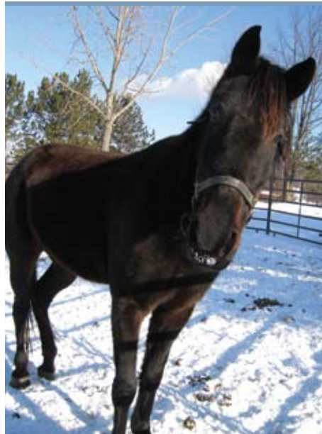
ARC Staff and Consumers volunteer with horses like Image at the Peaceful Acres Horse Farm in Pattersonville. The program is funded in part through a NYSARC, Inc. Recreational Grant.

The individuals that attend the program gain valuable experience in the areas of farm management and equine care. They also develop soft and hard skills that enable them to pursue employment and volunteer opportunities in animal care.