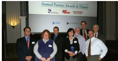
E/One accepting the award for Customer of the Year.